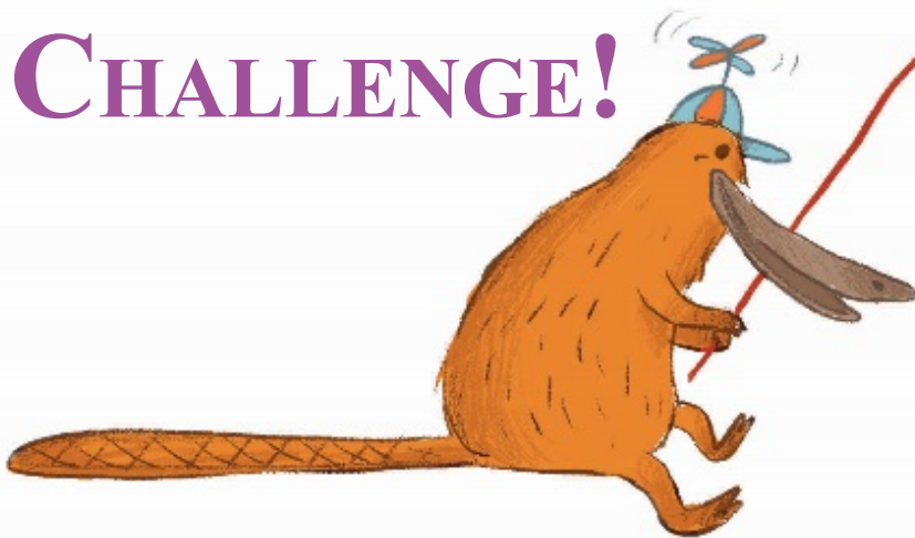
← Filbert the Platypus